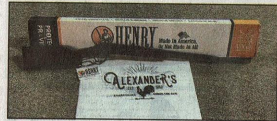
This Henry .22S/L/LR Rifle could be yours if you attend the March 2 Gun Club annual meeting and enter the raffle.

Importantly, the range will better assist the Union County Sheriff's Office, Blairsville Police Department and state law enforcement to conduct regular trainings,